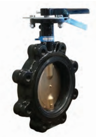
6411-00/6411-01/6411-03 (PICTURED WITH LEVER HANDLE)