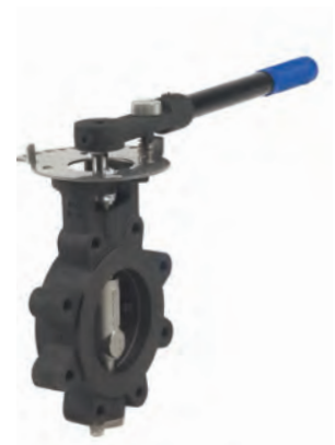
HPILCS WITH LEVER HANDLE